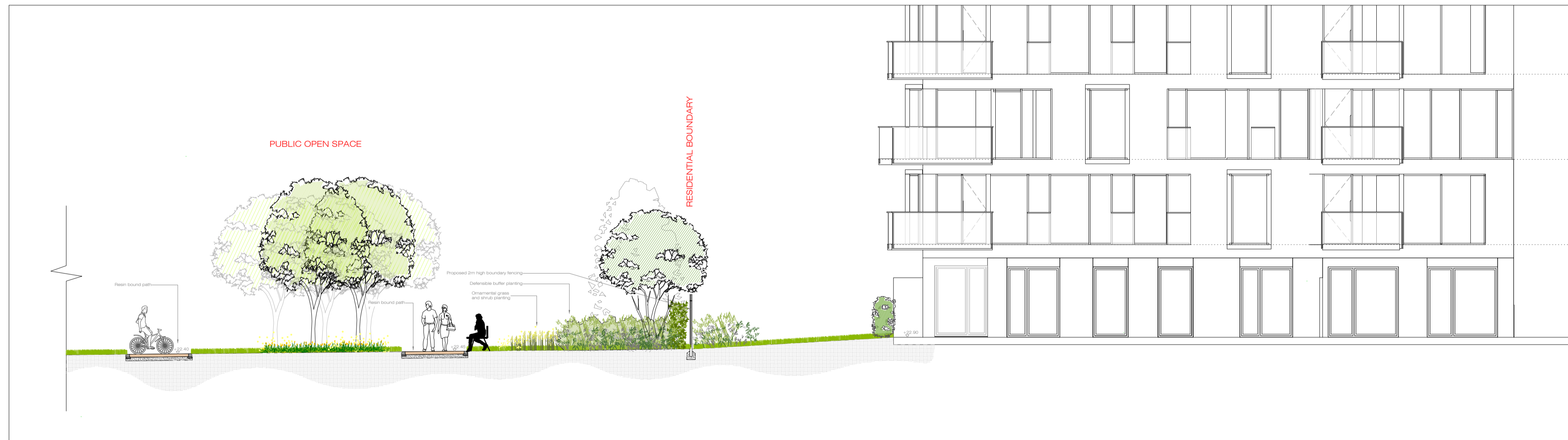
Section C-C scale 1:100