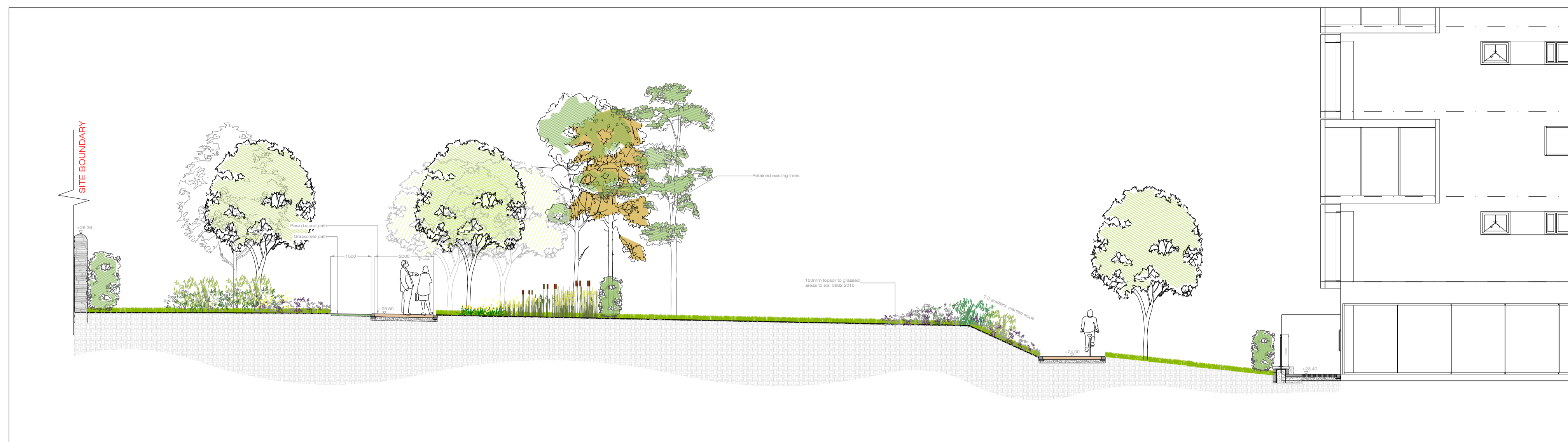
Section A-A scale 1:100