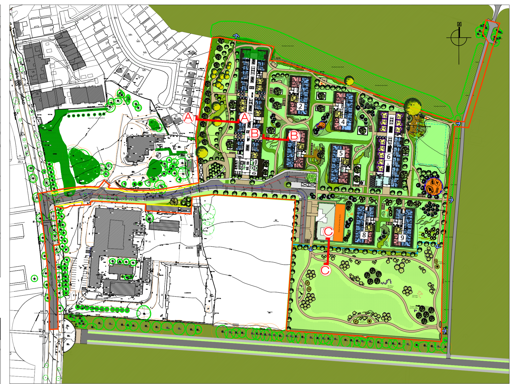
Key Plan scale 1:2000